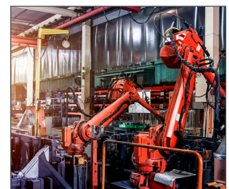
Robotics & Machine Learning