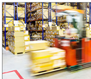
Warehouse & Distribution