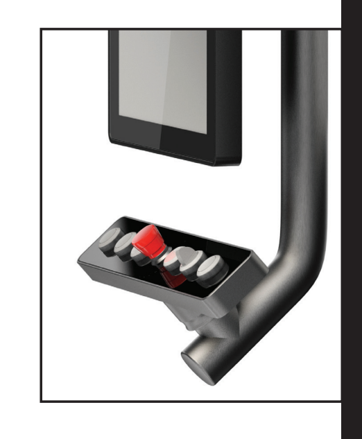
Mu This rang

Often in various sectors it is necessary to have easy access to several physical push buttons including Emergency Stop Button